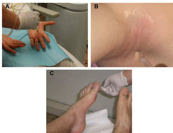
Figure 1 Treatment of primary palmar (A), axillary (B), and plantar (C) hyperhidrosis with lidocaine and botulinum toxin A delivered by JetPeel™-3.

Patients were randomized to receive a single session of 1) lidocaine 2% (Astra Formedic, Milan, Italy; 5 mL) delivered by JetPeel™-3 and subsequent multiple BTX-A (100 units (U); Bocouture®, Merz Aesthetics, Frankfurt am Main, Germany; BTX-A was reconstituted in 5 mL of saline solution) injections in the area affected by hyperhidrosis (group A [n=10]) or 2) lidocaine 2% (5 mL) and BTX-A (50 U diluted in the lidocaine for each palm, axilla, or foot)