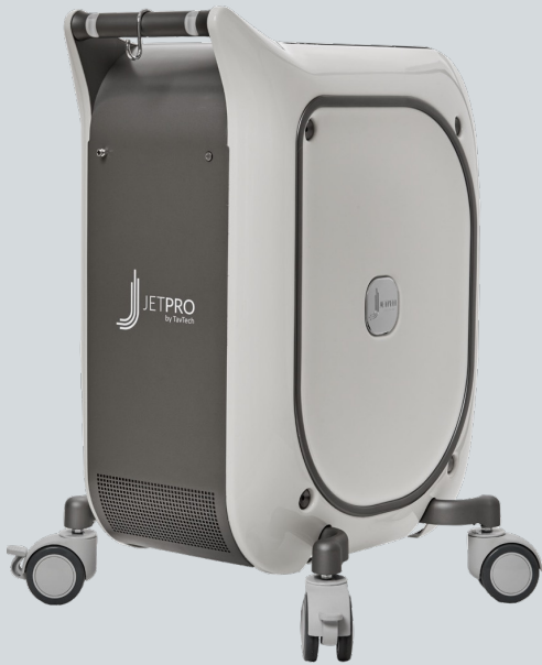
The enduring JetPro device