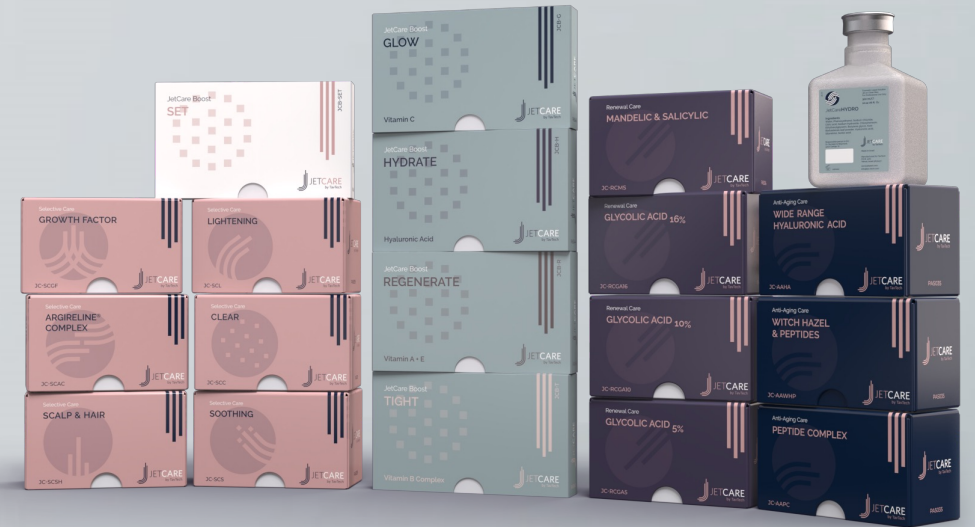
The premium JetCare solutions

Designed exclusively for use together to deliver outstanding results