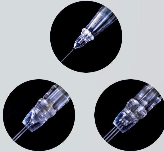
The original patented JetPeel handpieces