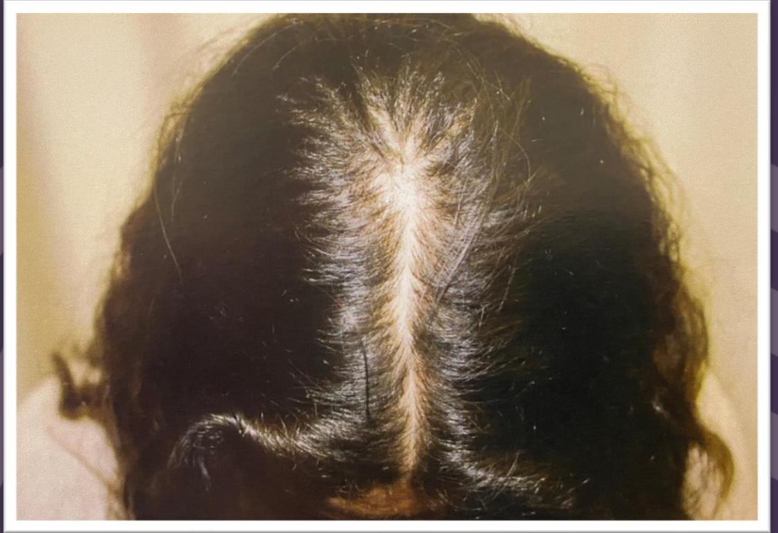
AFTER After 10 th treatment

Treatment solution: Minoxidil 5% alcohol-free liquid formulation